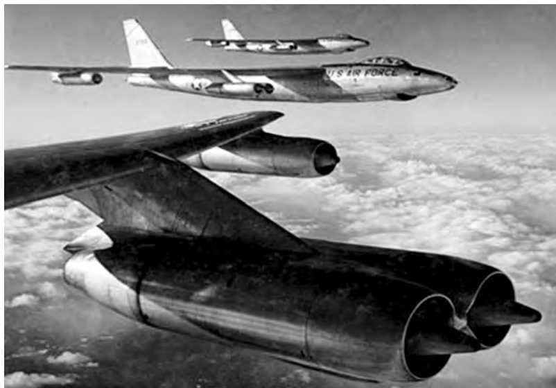
The jet-powered RB-47 filled the reconnaissance role for a short time, until more specialized aircraft were available.