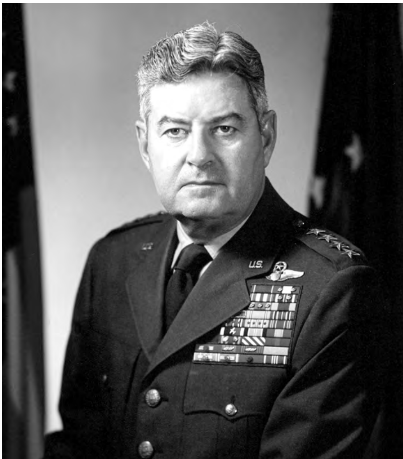
Gen. Curtis E. LeMay.

with little room but to see the hypothetical attack as one of preemptive or, at worst, preventive war.