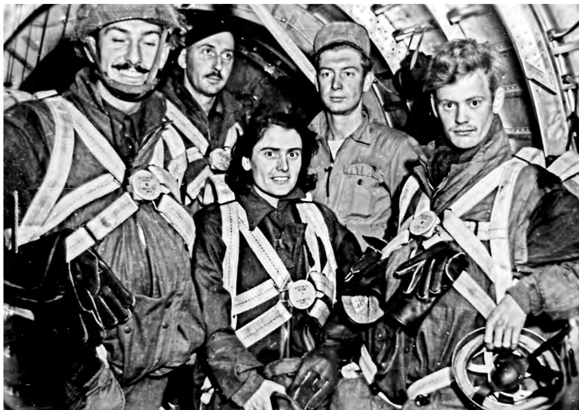
OSS agents and Carpetbagger bombardier inside a B-24.

Although 22nd Squadron crews were not qualified for strategic bombing, they would prove to be very well-qualified for their next assignment, which their top officers learned about at an October 1943 meeting at an RAF base northwest of London.