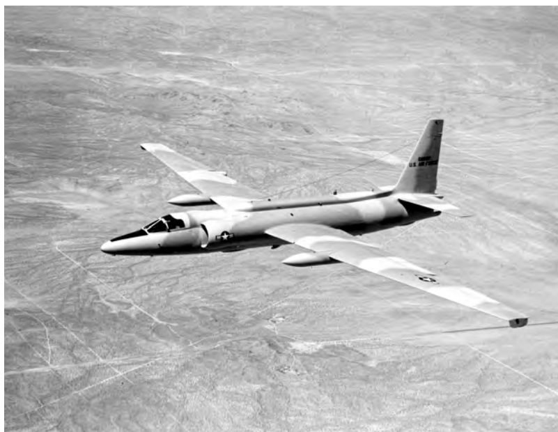
The U-2, a quick-reaction creation of Kelly Johnson's Skunk Works at Lockheed.