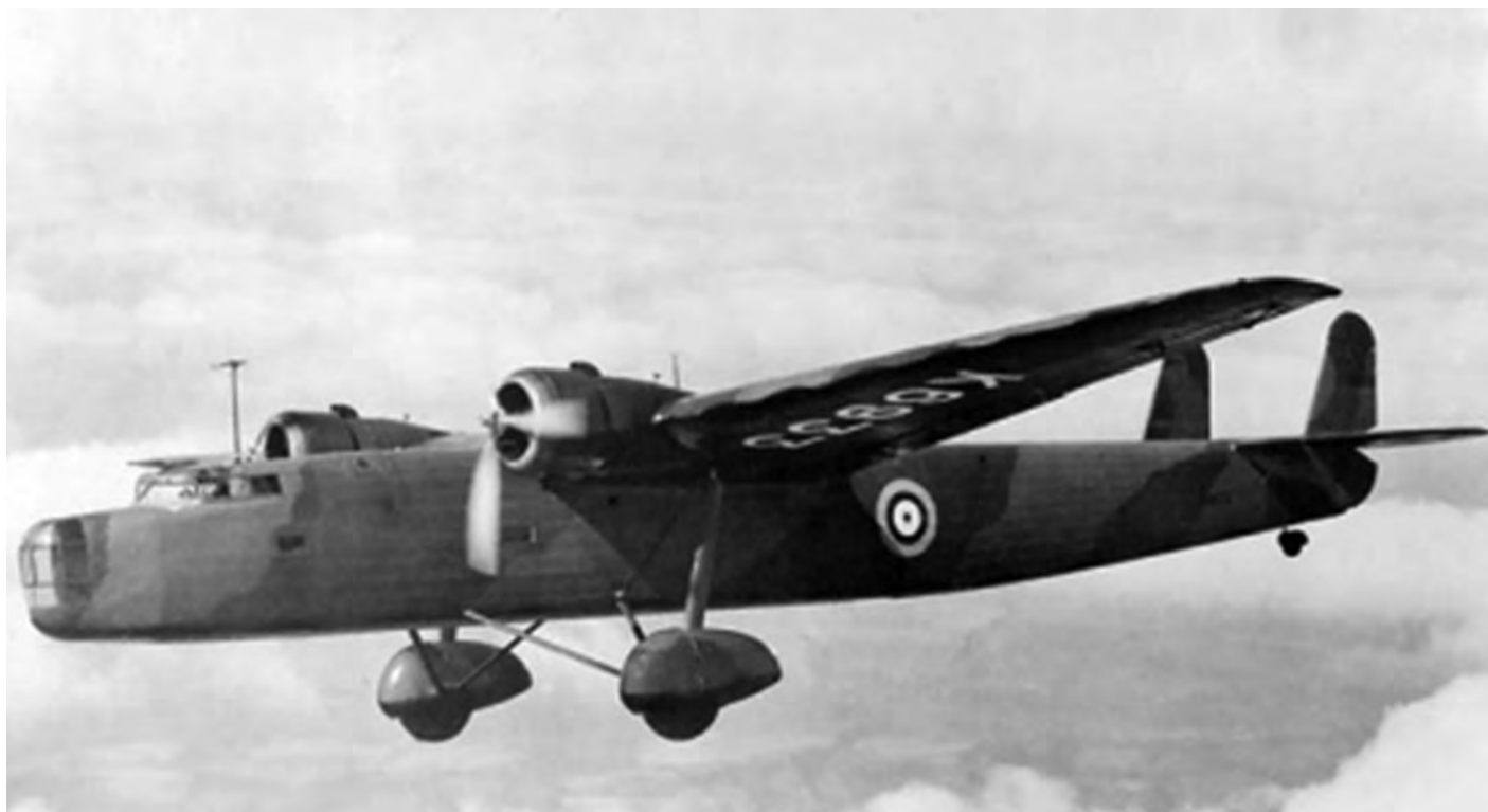
Handley Page Harrow.

THE ITALIAN REGIA AERONAUTICA SEEMS TO HAVE BEEN BETTER PREPARED FOR THE TRANSPORTATION NEEDS OF THE WAR.