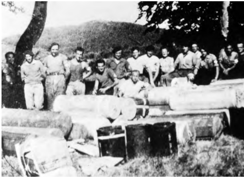
French resisters with containers.