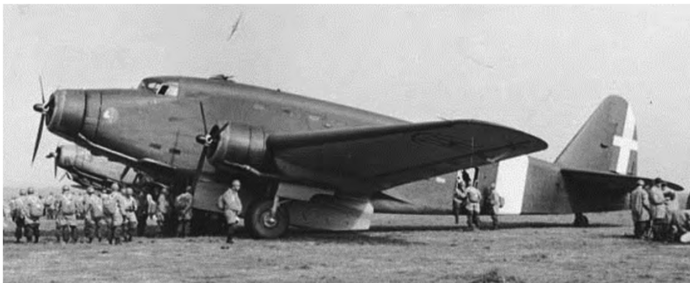
Savoia Marchetti S.82.

Ethiopian highlands: though often employed on courier and liaison duties it has the distinction of being involved in World War II's best documented instance of ground troops being stopped in their tracks by air bombing, the failed attack by 10th Indian Brigade under Brigadier W. J. Slim at Galabat on November 7, 1940. 13 It also with half a dozen of the civilian version, the Caproni Ca 148, made up the majority of aircraft assigned to the region's air transport unit. 14 The Italians had also given attention to the problem of supply over what at the time were regarded as extreme distances: between July 1940 and March 1941, Savoia Marchetti S.82 bomber transports carried out 330 eighteen-hour flights from Benghazi to East Africa, carrying 1,245 troops, 525 civilians, 81 tonnes of mail, nearly 240 tonnes of other supplies, 51 dismantled Fiat C.R. 42 fighters and 15 spare engines. This was basically a wasted effort, since the British overran Mussolini's East African empire anyway, but one that no other air force of that time could have attempted. 15