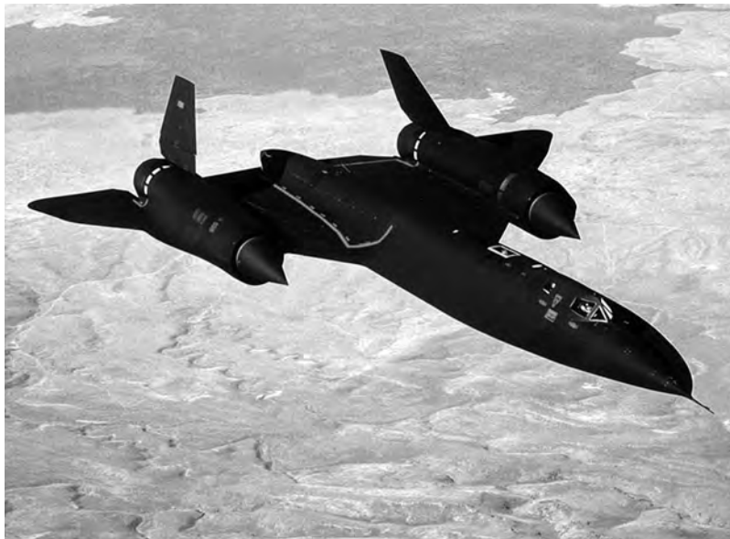
The groundbreaking SR-71. It was phased out to save money, not because it had become outmoded after thirty years.

Incident AFIC has all the answers and solved all the problems associated with supporting the nuclear enterprise. There are still challenges in trying to integrate nuclear mission requirements into the