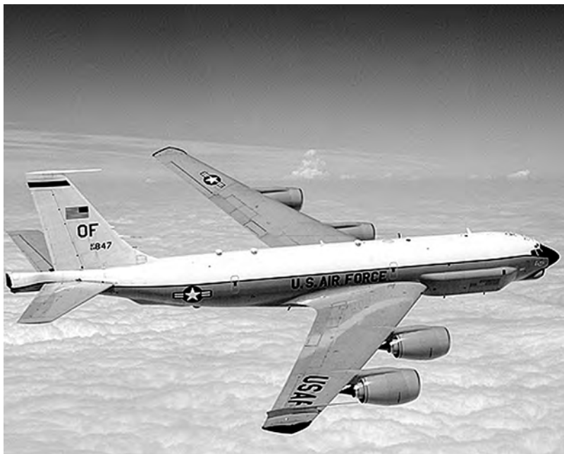
An RC-135 reconnaissance aircraft. This aircraft became a mainstay of SAC operations in a variety of different roles.